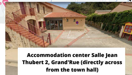
Accommodation center Salle Jean Thubert 2, Grand'Rue (directly across from the town hall)